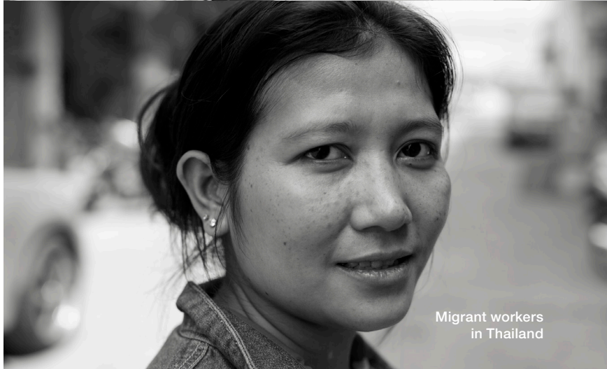
Migrant workers in Thailand