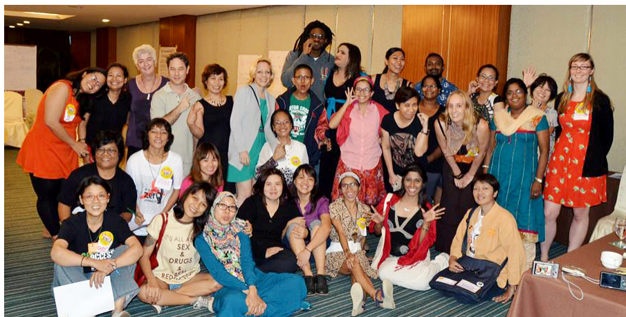
Participants of the Strategizing for the Key Affected Women and Girls (KAWG) Agenda in Post-2015 consultation

Strategizing for the Key Affected Women and Girls (KAWG) Agenda in Post-2015. Following ICAAP11, APA organized a one-day consultation meeting on 23 November with Unzip the Lips partners with the support of UNAIDS. The consultation strengthened CS advocacy capacity for national and regional HIV responses to more effectively address the needs and rights of key affected women and girls in Asia and the Pacific, and in the post-2015 development agenda. An advocacy strategy for the campaign was also developed for the next year.