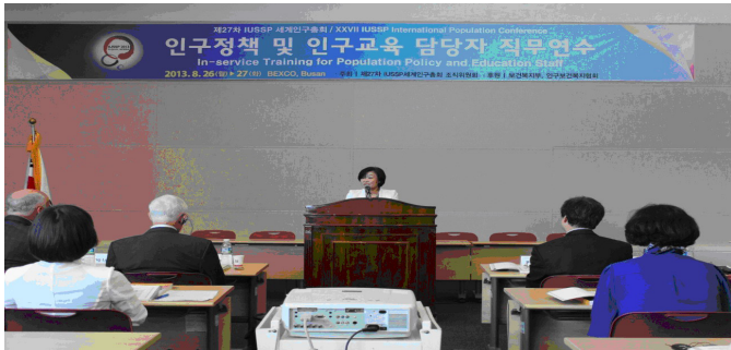
Side session at the 27th International Population Conference on “Population Policy and Education”

Raising awareness of SRHR among newly elected MPs and government officials through the 27th International Population Conference, 2013.