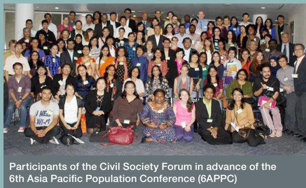
Participants of the Civil Society Forum in advance of the 6th Asia Pacific Population Conference (6APPC)

Two joint CS statements were presented to governments at the 6APPC, addressing growing inequalities between and within individuals and countries and highlighting key issues, including SRHR, sexual rights,