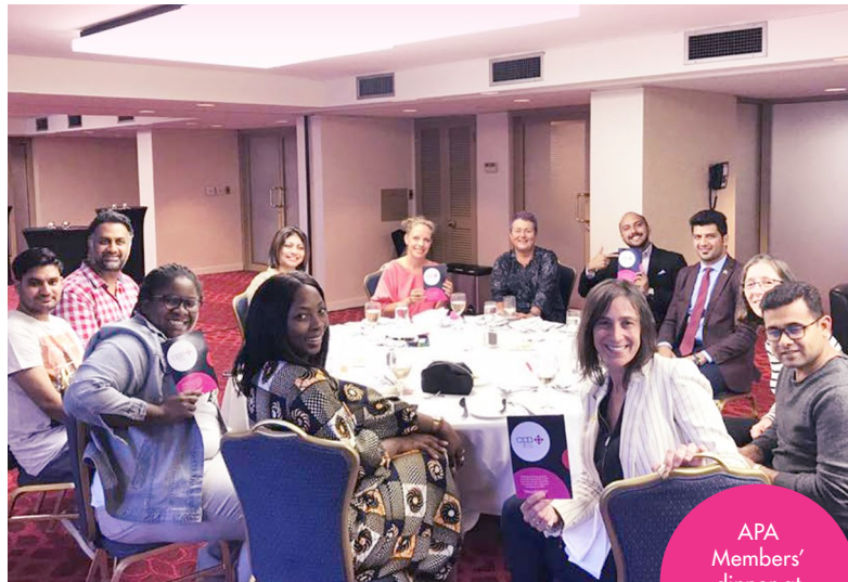
APA Members' dinner at Women Deliver

The global Women Deliver Conference had a theme of POWER. PROGRESS. CHANGE. APA unveiled our new branding and intuitive website alongside the meeting. We organised joint dinner to connect members representing Action Canada, Asia Catalyst, Youth Coalition, Family Planning New Zealand, Family Planning NSW, Youth Advocacy Network (YAN), Burnet and individual members. Members were briefed on the progress of the ICPD25, shared priorities and activities and discussed how civil society can engage more strategically in the process.