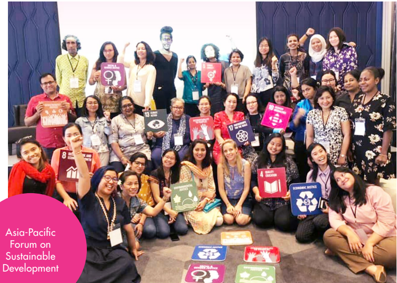
Asia-Pacific Forum on Sustainable Development

With a theme of empowering people and ensuring inclusiveness and equality , three APA members attended the preparatory civil society forum and intergovernmental meeting. We joined representatives of the Regional Civil Society Engagement Mechanism (RCEM) in a side meeting with H.E. Fidelis Magalhas, Minister of Legal Reforms and Parliamentary Affairs in Timor Leste, who chaired the meeting, and advocated for policy coherence between 2030 Agenda and ICPD.