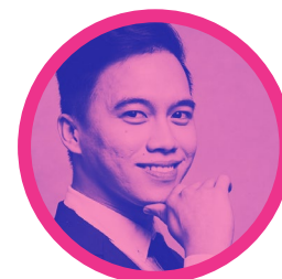
Lloyd Nunag Youth Coalition for Sexual and Reproductive Rights (YC) GLOBAL