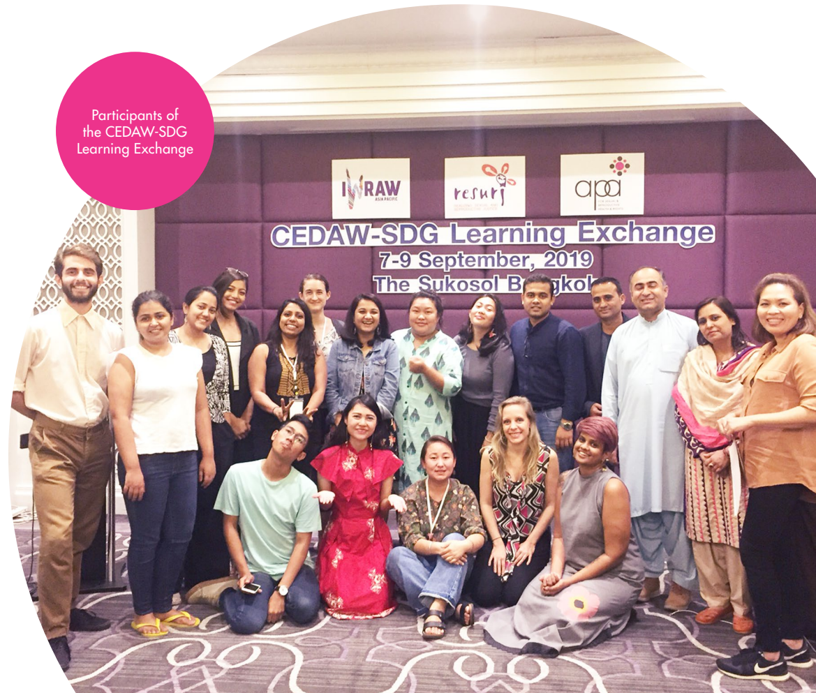
Participants of the CEDAW-SDG Learning Exchange

APA also contributed to regional and global coalitions and listservs to ensure that Asia Pacific SRHR issues are prioritised. We ensured that our members were continually updated on current initiatives and developments in the region. We also helped coordinate the Thematic Working Group on Gender, SRHR and Sexuality of the Asia Pacific Regional Civil Society Engagement Mechanism.