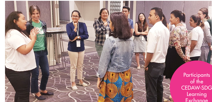
Participants of the CEDAW-SDG Learning Exchange